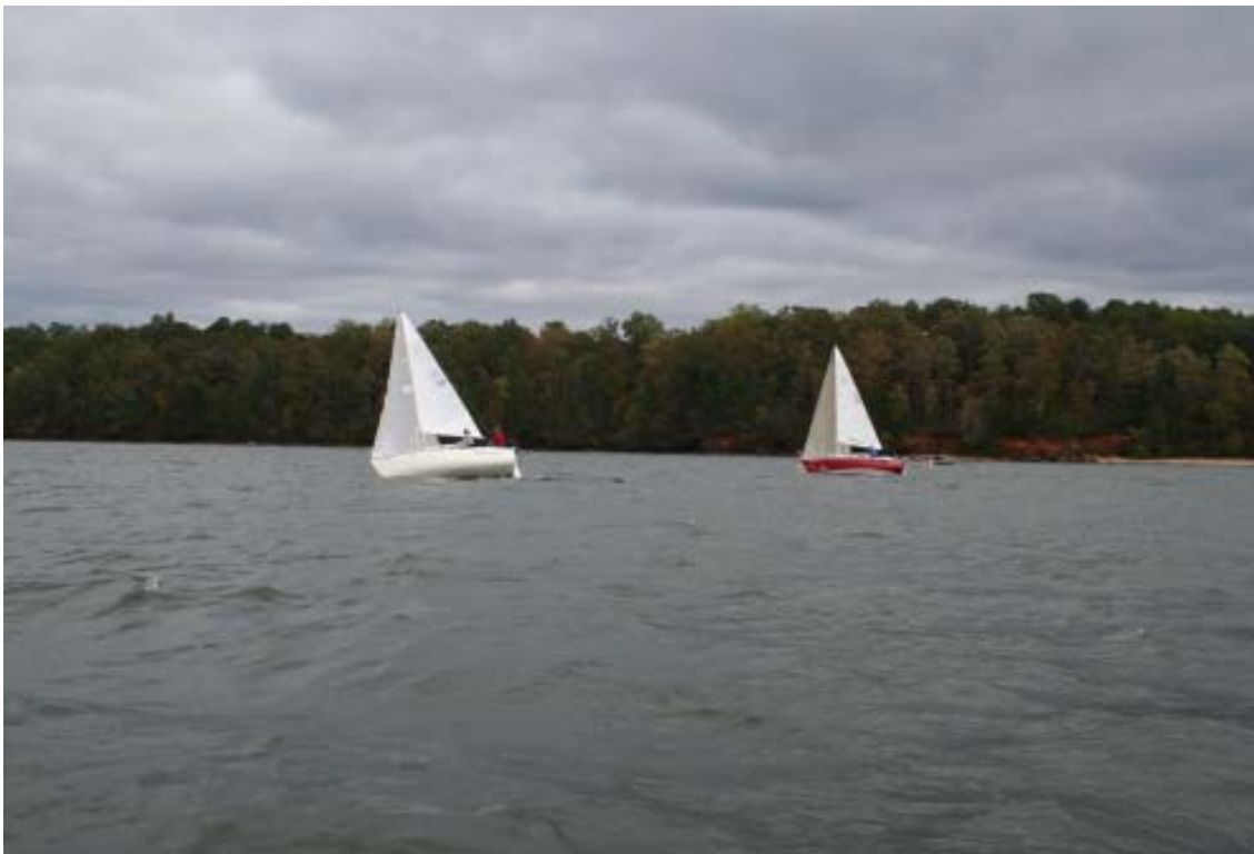
Keith and Pete havin fun in the Scotalina Tu Tu

We have more C22 and FS racers than crew and while in light air we don't mind going it alone, it would be nice to have some help at times. So if you are interested in learning more about racing or just want to get on the water, then contact the fleet captain listed in the roster and they can put you in touch.